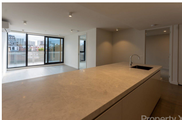
311 / 88 Cambridge Street, Collingwood VIC 3066 2 Bedroom - 2 Bathroom - 2 Car