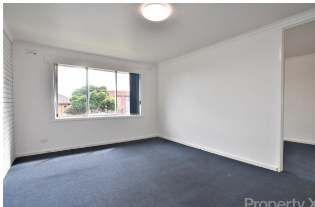
1 / 12 Empire Street, Footscray VIC 3011 1 Bedroom - 1 Bathroom - 1 Car