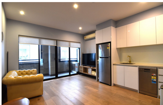
206 / 535 Flinders Lane, Melbourne VIC 3000 1 Bedroom - 1 Bathroom - Car