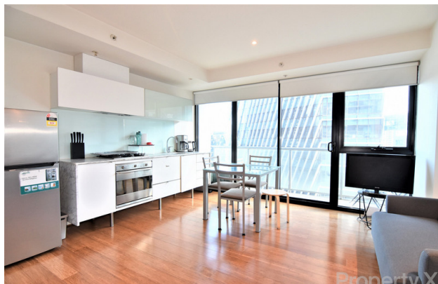
1502 280 Spencer Street, Melbourne VIC 3000 1 Bedroom - 1 Bathroom - Car