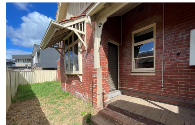
289A Maribyrnong Road, Ascot Vale VIC 3032 4 Bedroom - 1 Bathroom - 1 Car