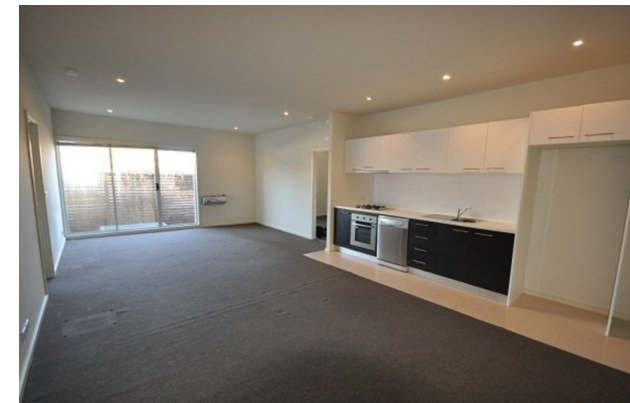
7 / 44 Leander Street, Footscray VIC 3011 2 Bedroom - 1 Bathroom - 1 Car